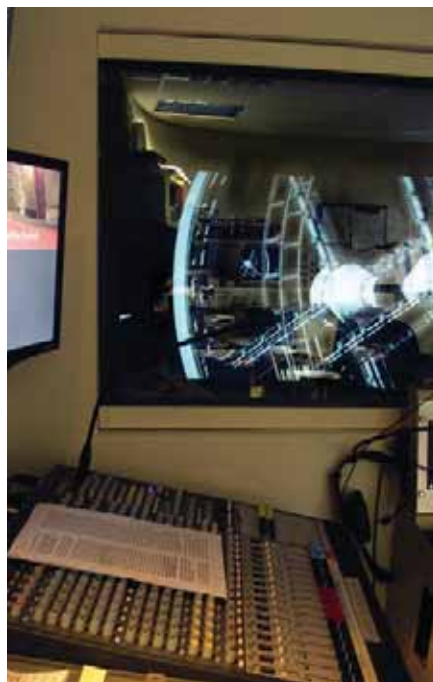
▲ The curved cinemas of the past ( above ) — a concept reflected in the Magi Pod system. ( Right ), 2001 as seen from the the projection box

means that, even if you have a bigger screen, you still only have a 2K image and you still only have 24 fps.