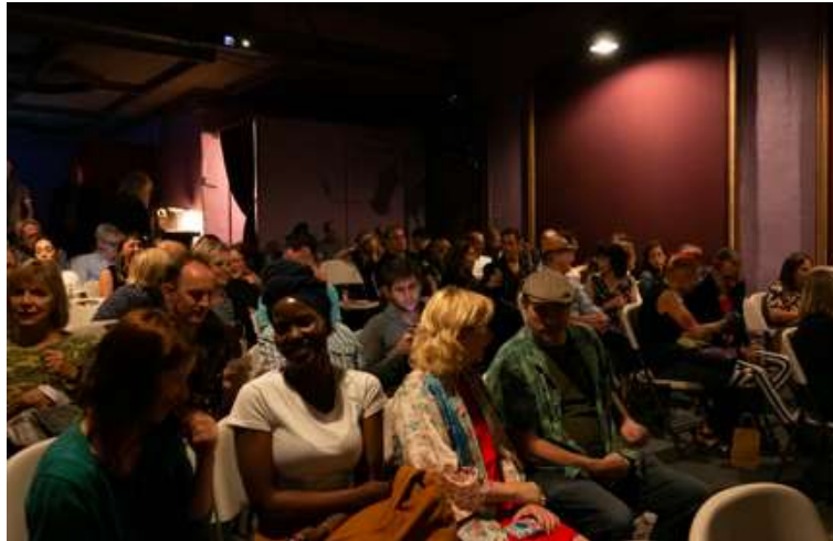
NYC 2019