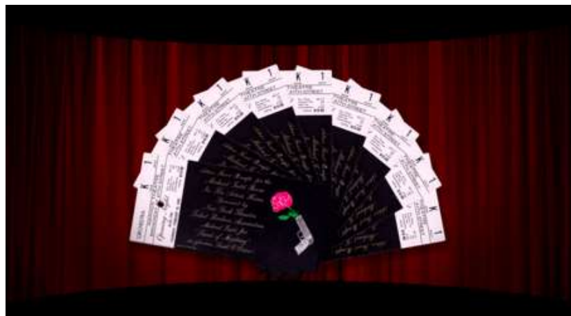
Your ticket to the history and future of scented cinema!