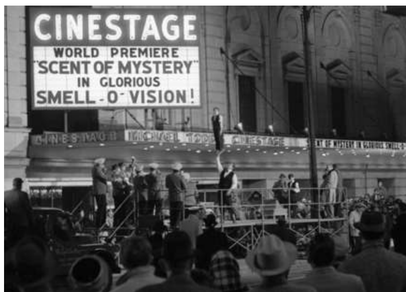
Chicago, 1960.