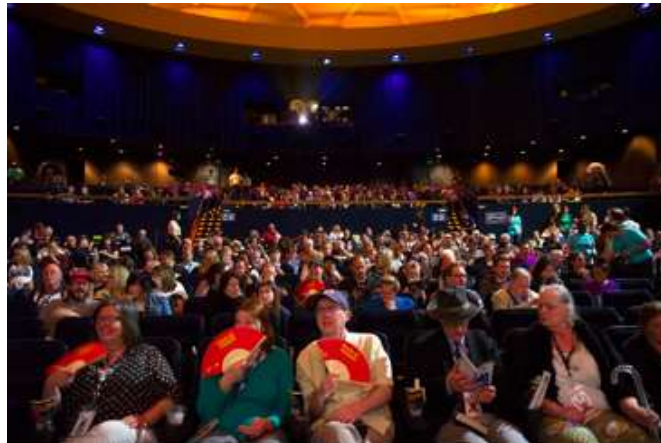
Cinerama Dome, TCM Classic Film Festival, 2016