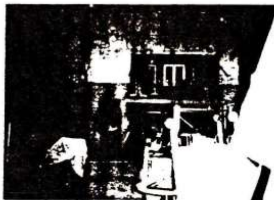
INTERIOR OYSTER BAY STUDIOS. 1988.

The recording desk originally stood under the balcony.