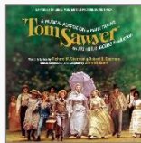
Soundtrack Richard M. Sherman and Robert B. Sherman