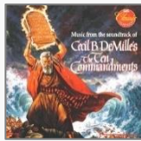
Soundtrack Elmer Bernstein